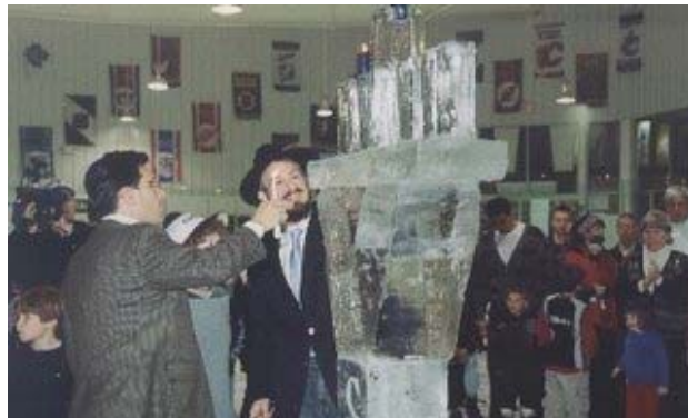
Congressman Eric Cantor

...Celebrates with representatives of Lubavitch.